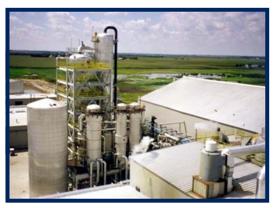
Ethanol production plant, Nebraska.

The ethanol industry currently employs about 200,000 people (directly and indirectly), and saves $2 billion a year in terms of oil imports. However, America's present trade deficit in crude oil is over $50 billion, so there is plenty of room for growth. Ethanol's total benefits in terms of farm incomes are greater - about $4.5 billion. There are over 60 ethanol production plants in operation or under construction,