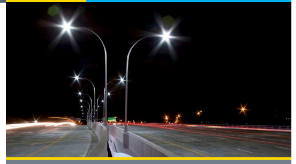
LED luminaires on the I-35W Bridge