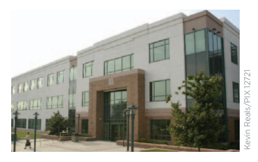
A complete renovation of the Social Security Administration Annex Building avoided $25 million in new construction costs and used recycled materials for 76 percent of its interior.

The U.S. Army, U.S. Navy, and U.S. Air Force face Federal requirements and mandates ranging from the Energy Policy Act (EPAct) of 2005 to the Energy Independence and Security Act (EISA) of 2007 to E.O. 13514. The U.S. Department of Defense (DOD) has