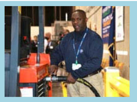
Bottom: Hydrogen station at Sage Mill Industrial Park

Middle: Fuel cell forklift at work in Kimberly-Clark warehouse