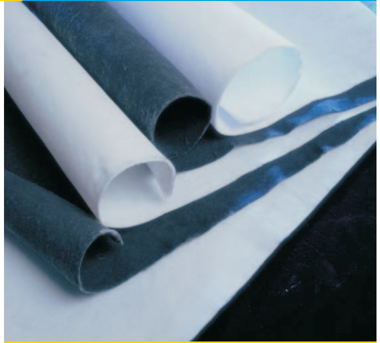
Aspen Aerogels manufactures inexpensive aerogel-based insulation in blanket form.

Traditional steam pipe insulation systems employ mineral wool, fiberglass, calcium silicate, perlite, or various foams. They are typically applied as rigid clamshells or blocks, then clad with sheet metal to protect from weather and service “wear and tear.” Aerogel-based pipe insulation performs a similar function but, as a flexible blanket material with intrinsic hydrophobicity, is not susceptible to the embrittlement or water logging that deteriorates traditional materials. Aerogel has very low thermal conductivity and recent processing developments allow its economical manufacture in blanket form. The most notable feature of aerogel insulation is that it significantly reduces the amount of material needed to perform the same thermal function.