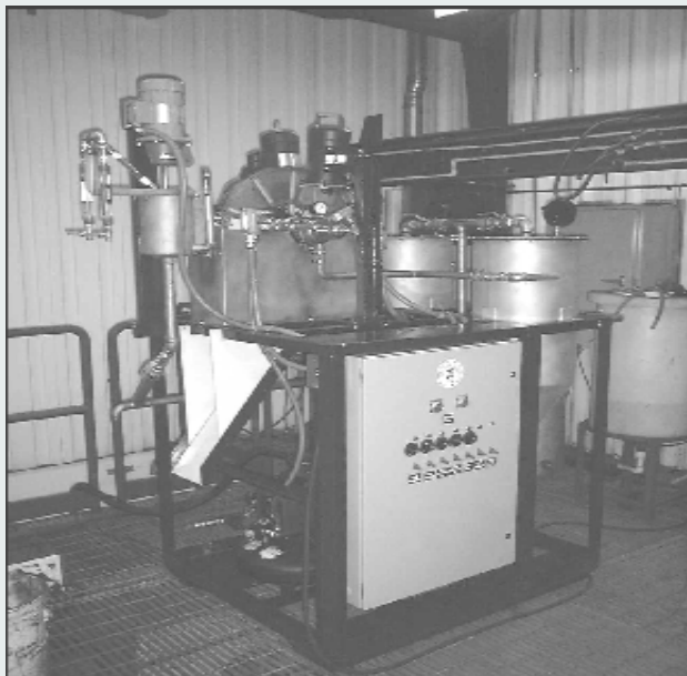
Pilot-scale disc filter used for dewatering tests.