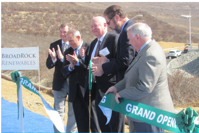
A ribbon cutting ceremony initiated commercial operation of BroadRock's Olinda plant in October 2012.

Using landfill gas to produce electricity also reduces greenhouse gas emissions indirectly, as it displaces fossil fuel-fired electricity generation. The indirect emission reductions total will be an estimated 311,000 tons of CO 2 per year for the two projects.