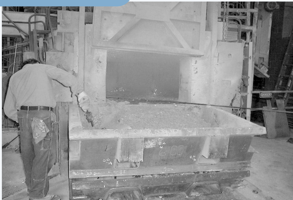
Operator tending a typical aluminum melting furnace.