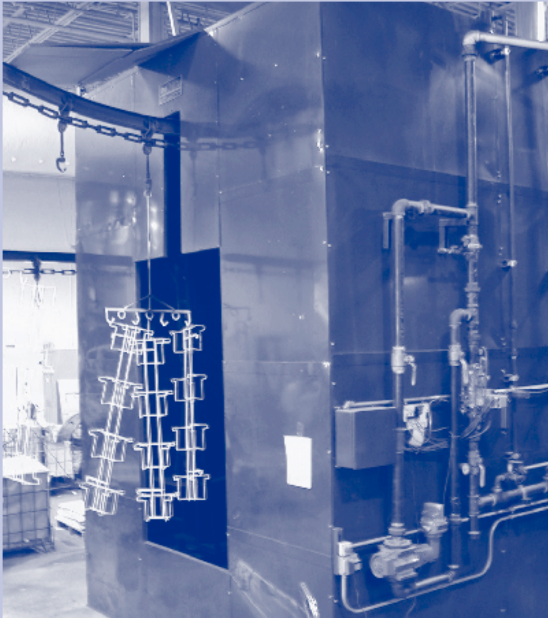
Pieces Entering Infrared Oven

convection oven. To minimize powder loss from the conveyor belt vibrations, Progressive placed the IR oven just 12 feet beyond the powder-coating booth. Because the IR oven can reach temperatures of up to 475°F, plant personnel realized that it could be used to pre-gel and cure powder coatings before the pieces enter the convection oven, thereby minimizing the amount of time they need to be in the convection oven.