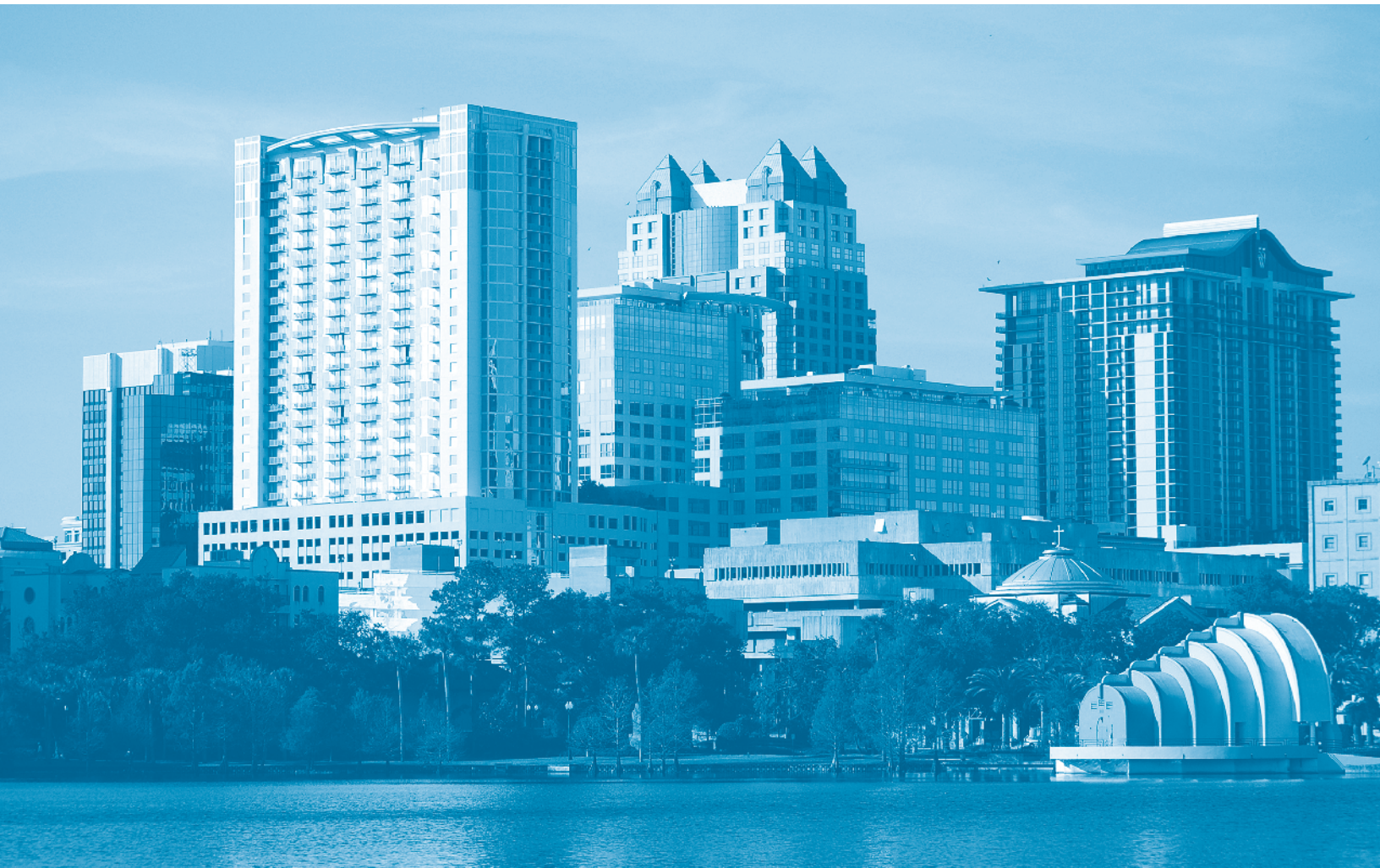
Downtown Orlando.