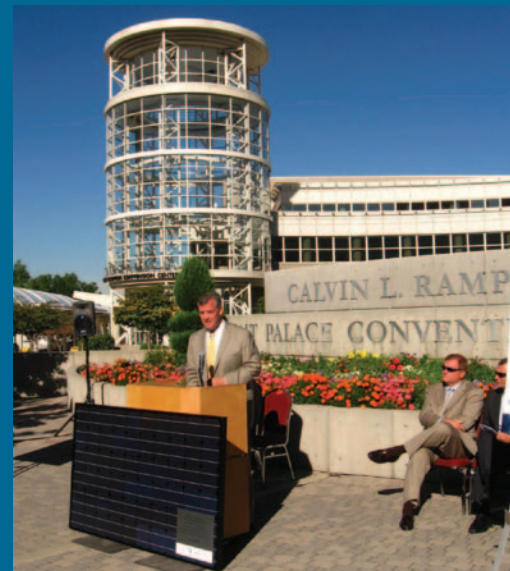
Clockwise from top left: Photovoltaic system in Philadelphia Center City district; rooftop solar electric system at sunset; Premier Homes development with building-integrated PV roofing, near Sacramento; PV on Calvin L. Rampton Salt Palace Convention Center in Salt Lake City; PV on the Denver Museum of Nature and Science; and solar parking structure system at the Cal Expo in Sacramento, California