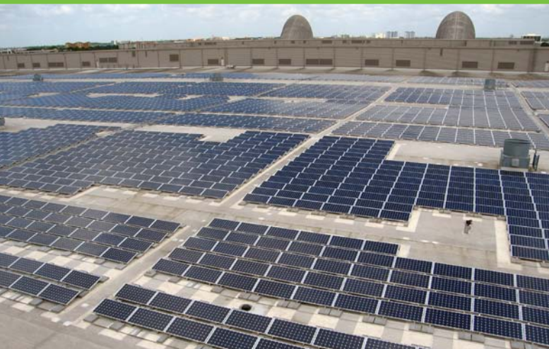
The solar array rooftop system on the south concourse of the Orange County Convention Center was completed in 2008 as a DOE Solar America Showcase.