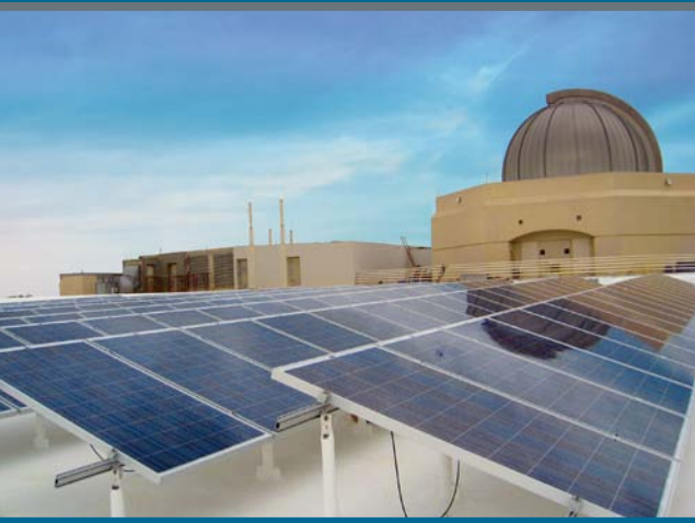
The Orlando Science Center features rooftop PV panels. Photo from Orlando Utilities Commission (OUC), NREL/PIX18715

Cover photos from iStock/8304000, downtown Orlando