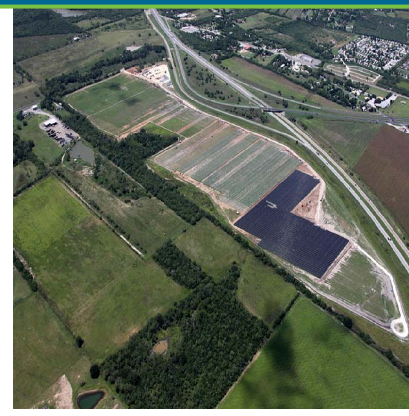
The Blue Wing solar project will provide 14 MW of power when completed.