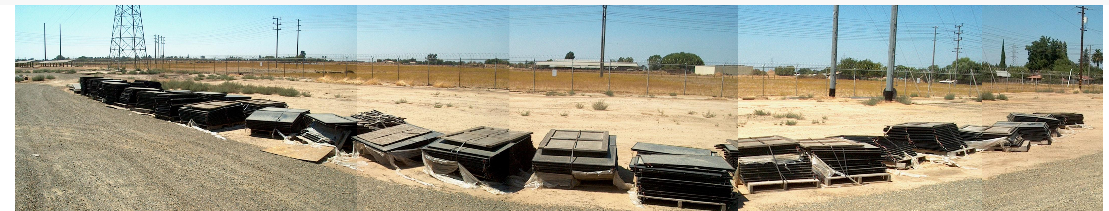
Photo 7: Panorama of poorly handled float glass a-Si for bid 2005.