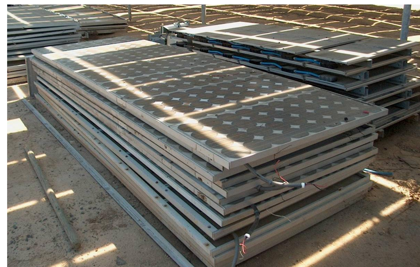
Photo 1: 2006 Stacked single crystal silicon salvage sales PV panels.

As photovoltaic (PV) system prices become less expensive, the salvage value can be increasingly important in life cycle economic calculations. This presentation examines data from historic utility salvage sales and reliability perspectives, and an actual 2011 salvage operation. From 2005 to 2010, large volume PV modules sold at salvage for a variety of pricing dependent upon strength of glass, amount of easily recycled aluminum, industry reduced average selling price (ASP) of new modules and expectations for future energy production. Reliability of product, both real and perceived, are important factors in resale valuations.