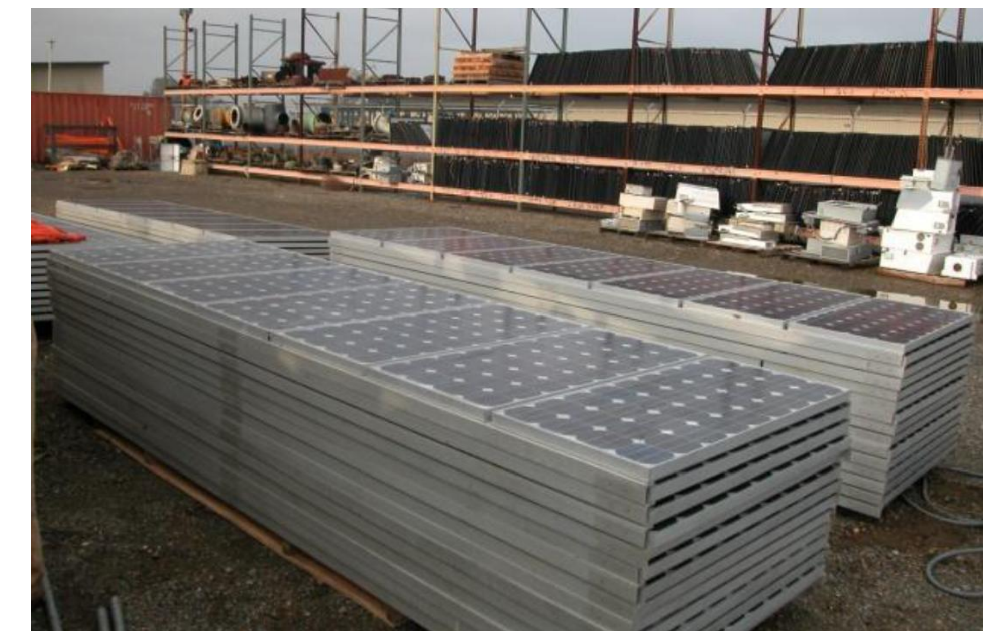
Photo 6: Well cared for and stacked modules obtain best resale bid price.