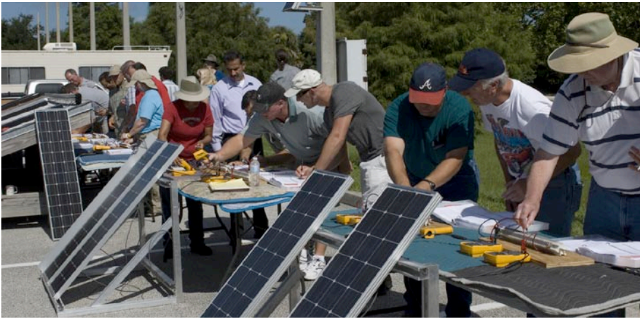
(left) Train the Trainer” participants dive into five days of solar technology education.

DOE’s Solar America Cities program recently held a “Train the Trainer” event at the Florida Solar Energy Center at University of Central Florida to help continue the growth of solar jobs. Eighteen attendees from eight cities participated in the training, held July 20-24. The goal was to educate representatives about solar technologies and guide them in developing solar training curricula and programs within their communities.