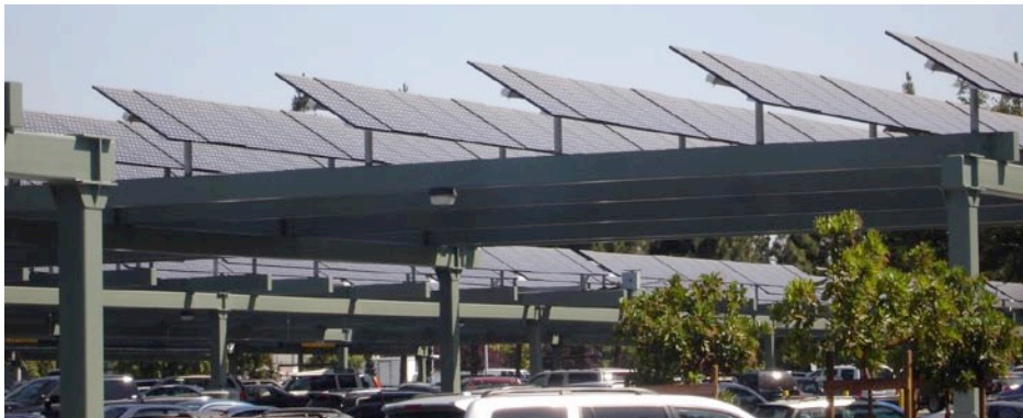
Tours for the SEPA utility solar conference included this PV solar array at Applied Materials.

SEPA held its first Utility Solar Conference July 27-30 in San Jose, California, as a forum for utility representatives to share information and discuss business strategies for bringing solar to utility scale. The event was targeted for utilities with retail customers and a small group of industry sponsors. DOE's Office of Energy Efficiency & Renewable Energy (EERE) was a sponsor for the event, and several representatives from SETP attended.