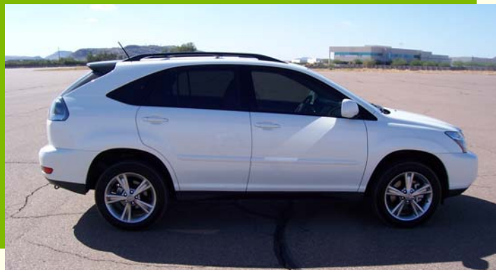
2006 Lexus RX400h VIN # JTJHW31U160002575