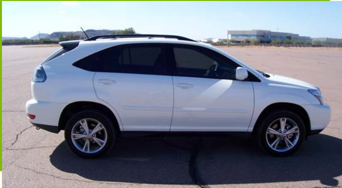
2006 Lexus RX400h VIN # JTJHW31U660004807