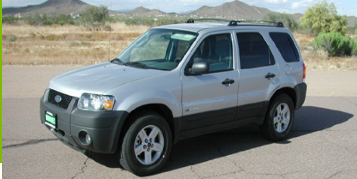
2005 Ford Escape 2WD VIN # 1FMYU95H75KC45881