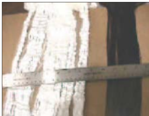
Carbon fibers produced by ORNL's Microwave-Assisted Plasma (MAP) process have significantly higher tensile modulus and strength than fibers produced by conventional means.