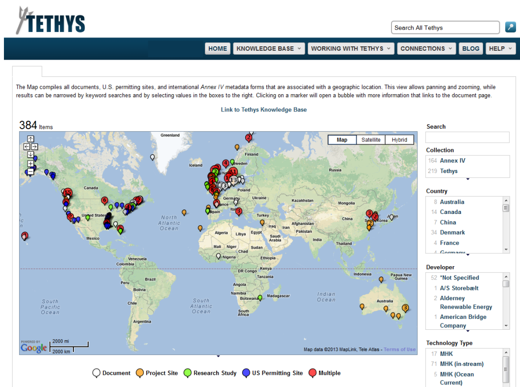
Figure 1. Tethys Map view