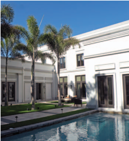
The New American Home 2011

Continental Homes & Interiors: 407-226-3546