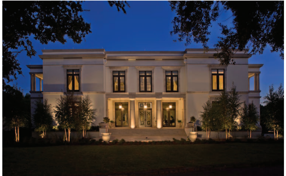
The New American Home® 2011, Orlando, Florida