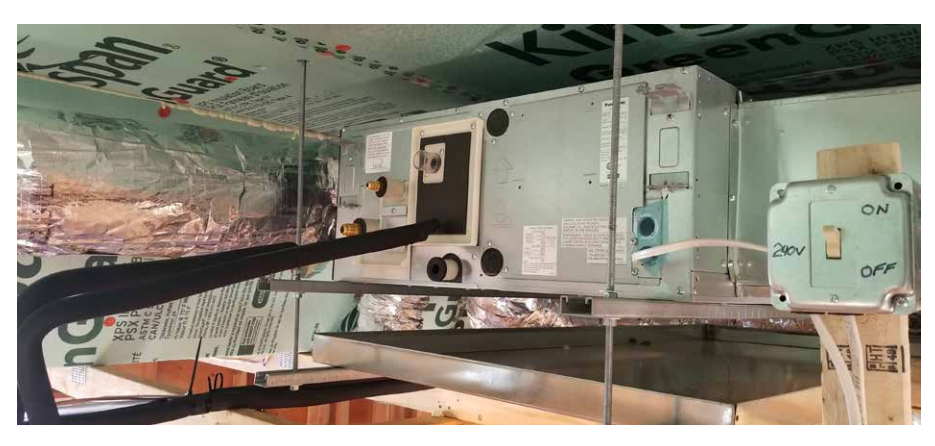
A unique HVAC chase was designed into the roof trusses and constructed of 2-inchthick XPS rigid foam providing a conditioned space for the highly efficient heat pump.

Bearing in mind that some Long Islanders are still struggling with the challenges of rebuilding their homes after Superstorm Sandy, Long Island United Way determined that its high-performance homes must also be able to withstand the impacts of weather events. The triple-pane windows used on this project use glass with a 120-mile-per-hour impact rating. The window frames are made of corrosion-resistant vinyl and the frames are a tight-fitting casement style although the window design includes mullions and check rail to mimic the traditional look of a double-hung windows. The triple-pane glass package includes two layers of low-emissivity coating, which helps boost the windows' insulation value to an overall value of R-5.5 (U-0.19).