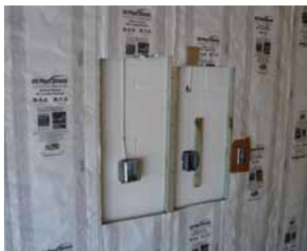
Double battens on block wall allows electric installation without creating penetrations in block

Additional features in LifeStyle's SunSmart SM homes are extensive air sealing with long life caulk and foam, comprehensive placement of drainage planes, joints and connections and attention to window and door openings. All of these features, including properly installed insulation (no gaps, voids or compression - grade I) in the walls and attic, promote home durability and energy efficiency.