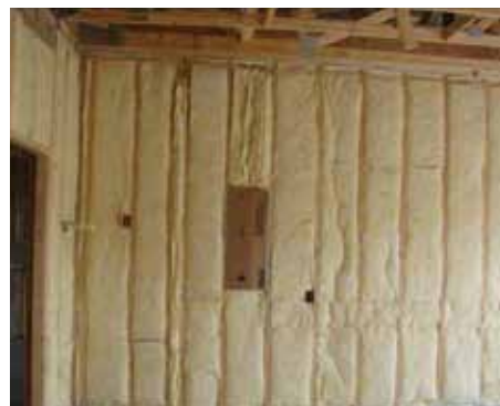
RESNET Grade 1 insulation on frame walls as required by the ENERGY STAR ® Thermal Bypass Checklist