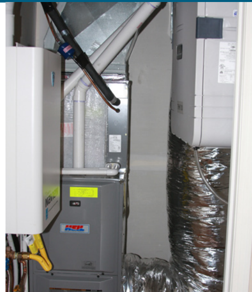
Artistic installs high-efficiency furnaces and ducts in conditioned space and provides a fresh air intake and heat recovery ventilator with HEPA filter for greater efficiency, air quality, and comfort.

Artistic Homes offers homeowners web-based data collectors for hour-by-hour monitoring of their energy loads. The systems are free for homeowners participating in a 2-year study to help Artistic find ways to make its homes even more energy efficient.