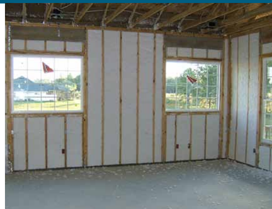
Blown fiberglass wall insulation and advanced framing details like ladder blocking and two-stud corners help Tommy Williams Homes achieve high energy performance on all of its homes.

The solar water heater has a 64-ft 2 collector, 120-gallon storage tank, and an electrical backup system. Passive design strategies to protect the large window areas from solar heat gain include a recessed alcove and 24-inch overhangs all around the house. The windows also have low-emissivity coating.