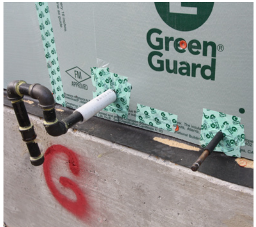
(Top) Attics and walls are insulated with spray foam for superior insulation and air sealing to achieve house leakage of less than 2.5 air changes per hour at 50 Pascals.

(Bottom) [Interior view] The home is sheathed with rigid foam insulation and all seams and holes are taped to provide a continuous air barrier.