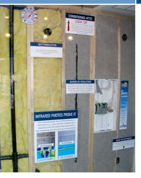
Pulte markets its energy-efficient features in information rooms that show potential buyers side-by-side displays of Pulte building science technology versus code minimum techniques.