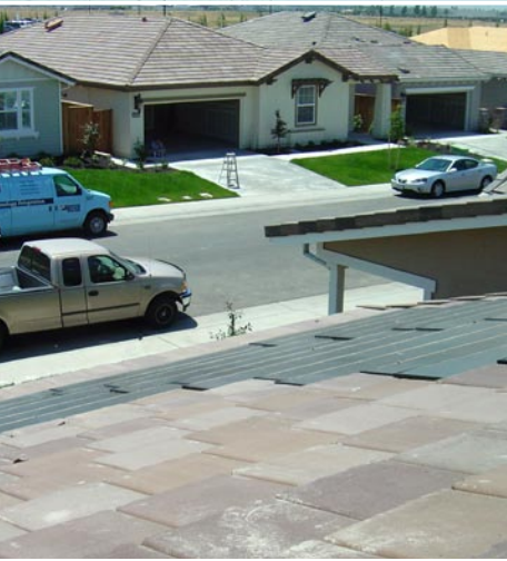
Powerlight integrated solar roof tiles blend in with surrounding roof tiles to provide 2.4 kw of clean, quiet energy.