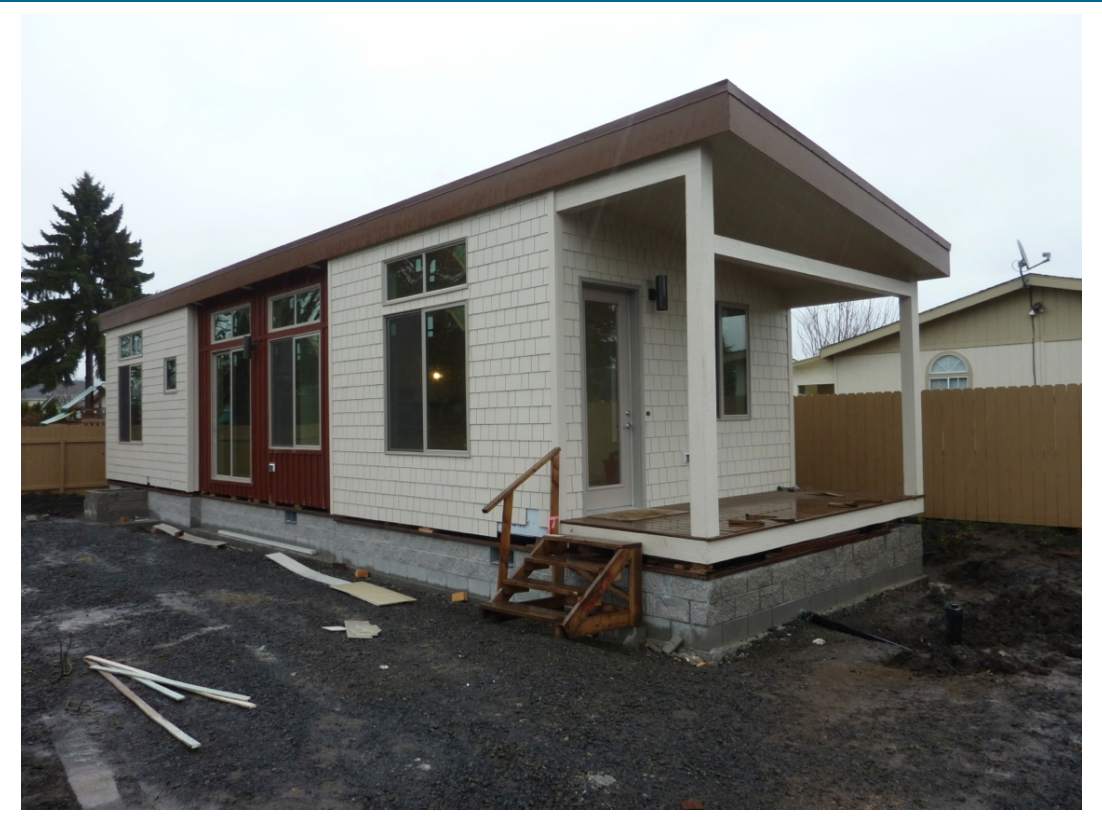
Figure 4. Exterior foam-sheathed home after transport

The project team also worked with another plant to explore how foam sheathing might be incorporated into its construction processes. The second plant found that the 2½-in. length limitation for siding nails left insufficient nail penetration into the wall framing for the wall assembly to meet the siding manufacturer's warranty requirements. The fastener supplier confirmed that longer nails were available only in heavier gauge fasteners. The solution for this plant may be to use 5%-in. thick R-4 polyisocyanurate foam sheathing and look at other tradeoff opportunities in the home's thermal package.