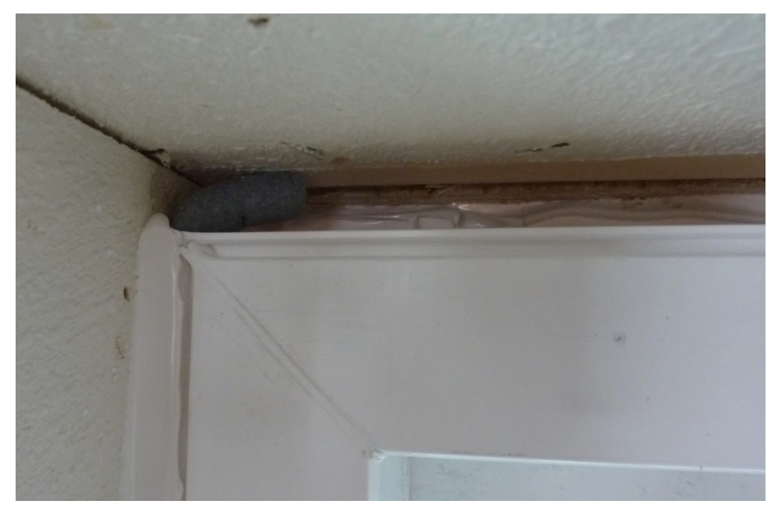
Figure 6. Backer rod and caulking as secondary air seal