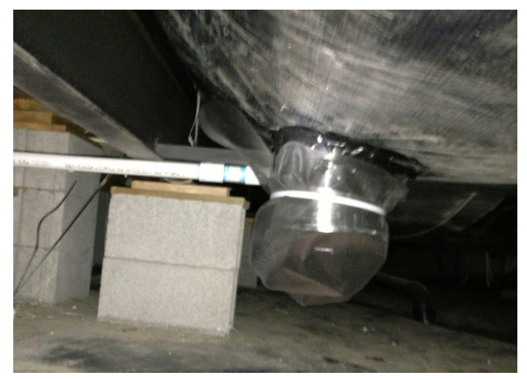
Figure 15. HPWH screened inlet located in vented crawlspace

home laboratory as a surrogate for an actual prototype home built in the factory. The PNNL laboratory homes are equipped with General Electric (GE) HPWH units that are not designed for ducted operation. The project team sponsored additional research testing at the PNNL facility, wherein one of the GE HPWH units was modified to accept duct fittings, and an inline fan was added to generate appropriate airflow through the ductwork. As modified, the HPWH was set up to pull air from the home's crawlspace and exhaust it to outdoors. Figure 15 shows the screened air intake in the crawlspace, and Figure 16 shows the exhaust ducting with inline fan fitted to the HPWH. The laboratory's monitoring and control equipment is being used to detect HPWH compressor operation and energize the inline fan in response.