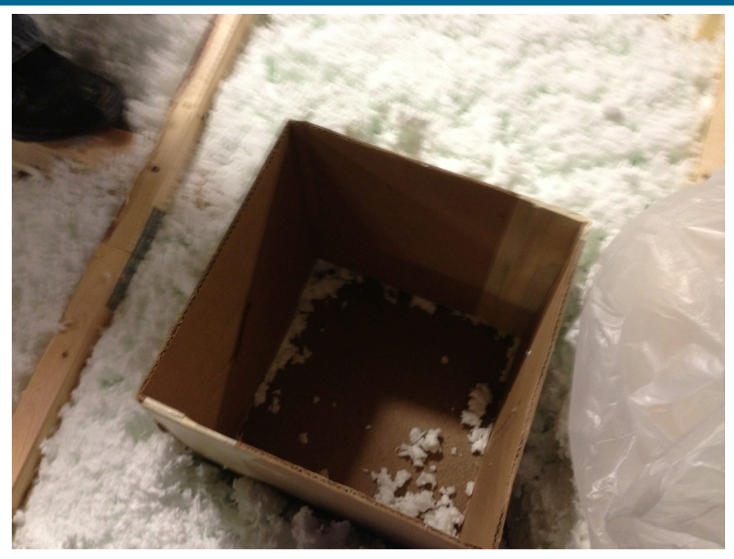
Figure 11. Core sampling of dense-packed insulation