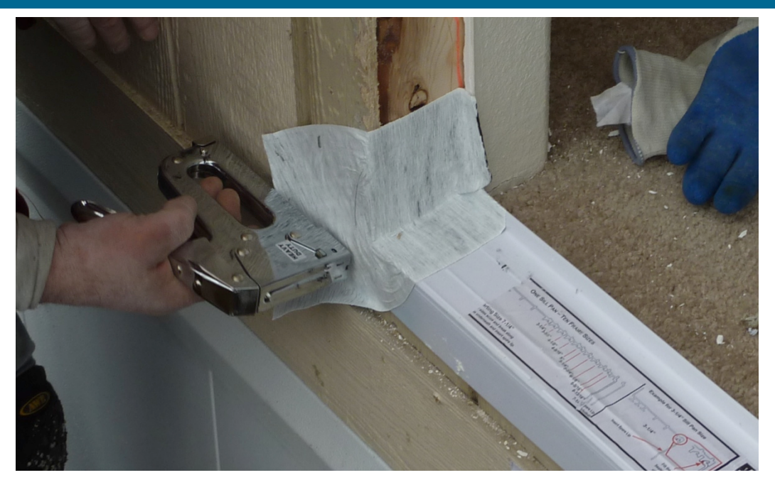
Figure 7. Sill pan for sliding glass door