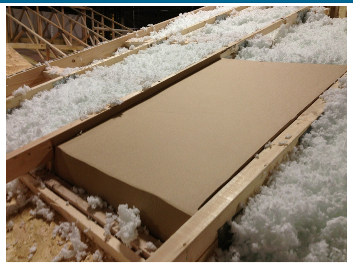
Figure 10. Baffle retaining compressed loose-fill insulation near eave

The current loose-fill insulation practice being used at the plant where the prototyping exercise was performed often results in the eave areas being underinsulated. Much of the eave area typically is blown with greater than a 1-in. airspace, and core sampling indicated that insulation was being installed at less than the manufacturer's required density. Weighed samples showed that insulation was being installed at 0.68 lb./ft<sup>3</sup> versus the manufacturer's specified minimum density of 0.9 lb./ft<sup>3</sup>. The insulation density improved sufficiently in the roof areas where it was installed at greater depth. Consequently, the plant's current process is causing approximately a 25% reduction from the expected R-value of the insulation near the eaves.