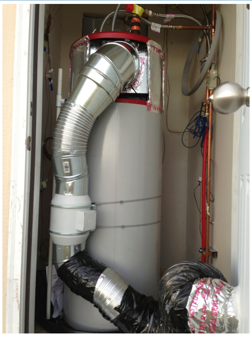
Figure 16. HPWH modifications to allow fully ducted operation

The project team is pushing to prototype a HPWH configuration that draws air from the house crawlspace, transfers heat into the DHW tank, and then exhausts the resultant cooler air to the outside, because this configuration has no impact on indoor air temperature or home ventilation systems, which greatly simplifies the home's mechanical systems. While this configuration can be expected to suffer a reduction in HPWH efficiency compared to one that makes use of indoor air, the project team finds this outcome acceptable when compared to attempting to obtain near-term deployable solutions to the challenges of introducing up to 200 CFM of makeup air into a home that is relying upon indirect conditioning of secondary zones to maximize the DHP's heating contribution or working with equipment manufacturers to develop new control strategies that permit interaction between HPWH, DHP, and home ventilation equipment.