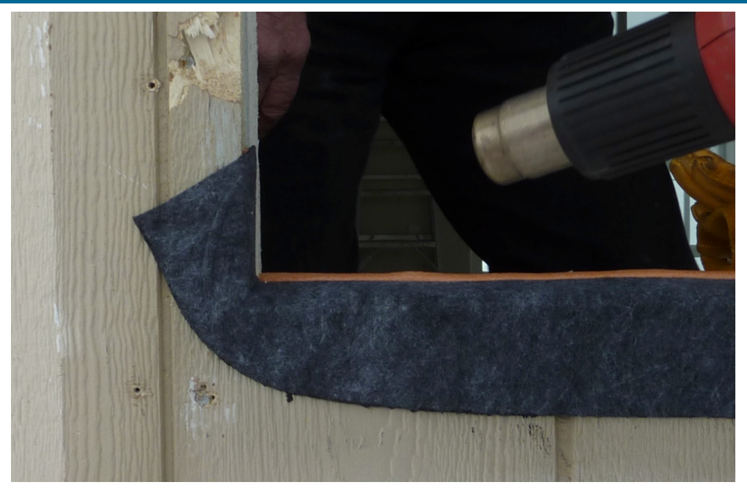
Figure 5. Flexible flashing window sill pan