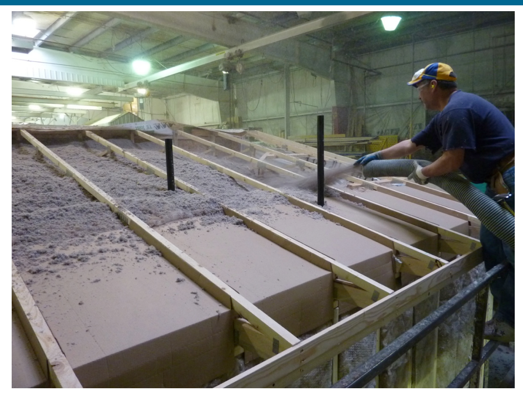
Figure 9. Transition to blown-in insulation for deeper attic cavity area

The second attic assembly prototyped used dense-packed loose-fill insulation at the eave area. The same baffles that were used for the fiberglass batt detail proved to work effectively for this application. Dense packing insulation at the eaves can be used to improve the thermal performance of almost any attic system being insulated with loose-fill insulation where space is constrained near the eaves.