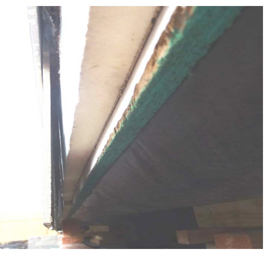
Figure 2. Wall cladding with exterior foam sheathing

installed outboard of sheet good siding products and sealed to the siding, as currently is done by all plants with their conventional wall systems.