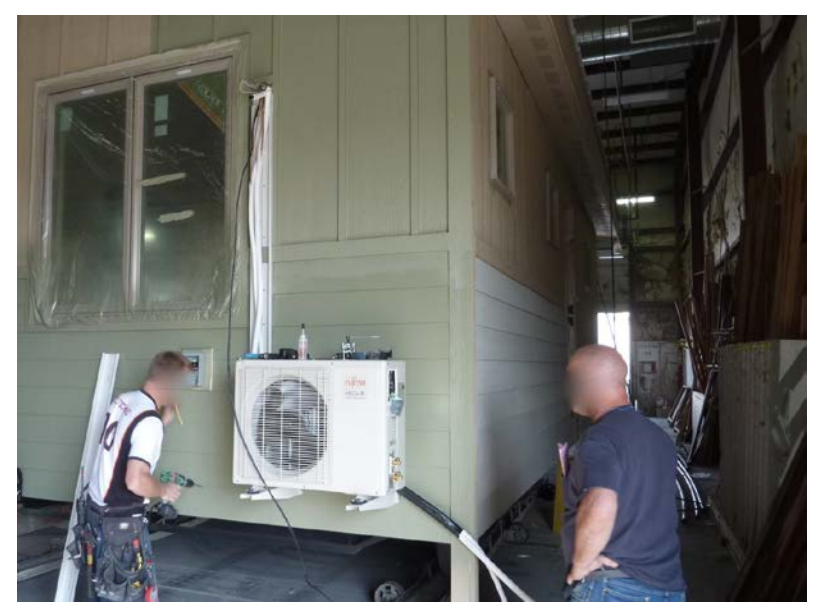
Figure 13. DHP compressor on end wall with indoor head on other side of wall—"up and in" installation

the home proved to be vulnerable to damage by the transport rig. Sidewall mounting presents similar vulnerabilities, and over-width considerations further limit the potential applicability of this mounting strategy. Many homes built in the Pacific Northwest are sited in western Oregon and Washington—areas with a marine climate. For such applications, using a DHP that has published capacity data for lower temperatures than the U.S. Department of Energy-specified 17°F rating temperature can allow the heating system to be designed without installing supplemental heating in the main zone of the home in many cases, because the DHP still has ample capacity at the mild heating design temperatures common in the marine climate zone—a cost savings and a possible perceived benefit from an aesthetic perspective.