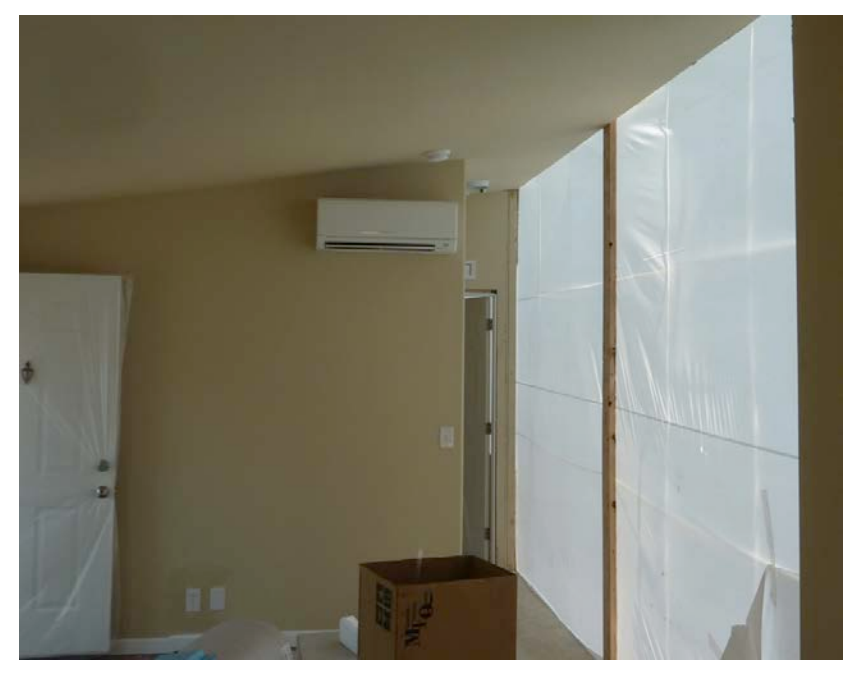
Figure 12. DHP indoor head mounted in main zone

especially in extreme conditions. Installing ceiling fans in secondary zones may help evenly cool the home, especially if secondary zones have significant southwest-facing glazing. Additional research is needed to give guidance for designing systems that ensure adequate home cooling performance in areas with hotter summer conditions.