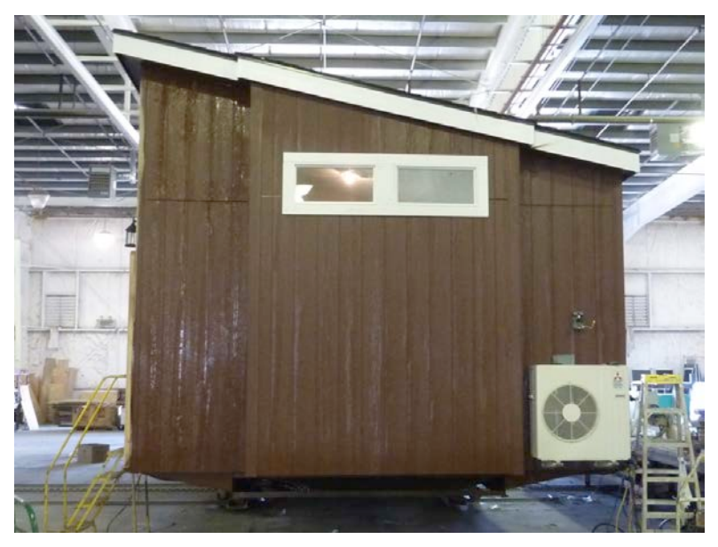
Figure 14. DHP mounting location integrated into home design