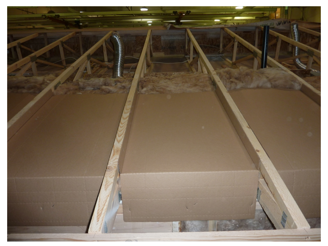
Figure 8. Compressed R-38 batts with baffles at eaves

The new roof insulation strategies for conventional trusses included using a 24-in. wide R-38 fiberglass batt in place of blown-in loose fill insulation in the area extending from the eave above the top wall plate—where the batt is compressed using a baffle but still has a higher R-value than loose fill fiberglass insulation-and inward for 4 ft (see Figure 8), where the attic depth is sufficient to transition to blown-in insulation for the rest of the attic (see Figure 9). The full width batts effectively fill in between roof truss members to prevent insulation voids. The insulation baffles selected for this application have 1-in. wide side flanges that are stapled onto the truss top chords to create the required ventilation space, and they have a tail that is stapled onto the outer edge of the wall top plate to further stiffen the baffle against the compressed batt and prevent wind washing of the insulation. The batt and baffle installation took about 20 person-minutes to complete a 40-ft long attic, and insulation blowing used 11/2 fewer bags of insulation per 10 ft of attic length. For the prototype home, this represented a 25% reduction in loose fill insulation and blowing time. Since the fiberglass batts and the baffles were purchased retail by NEW for the exercise, it is not possible to give an accurate measure of the full cost implications, but the detail likely adds about $140 to the cost to insulate a 40-ft long two-section home.