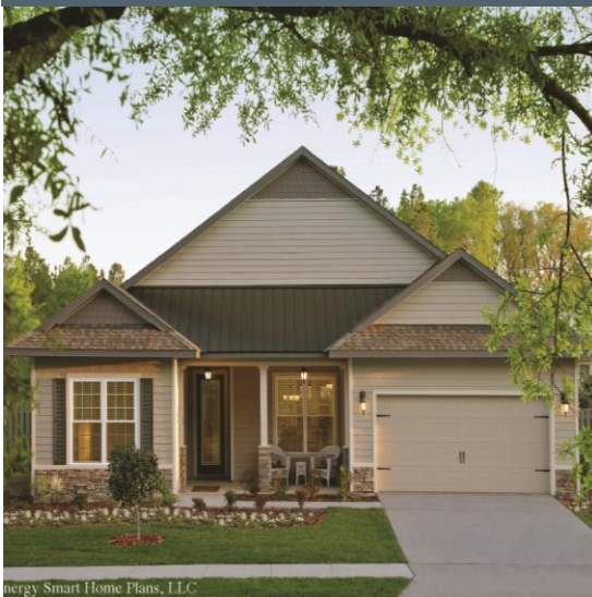
Energy Smart Home Plans, LLC