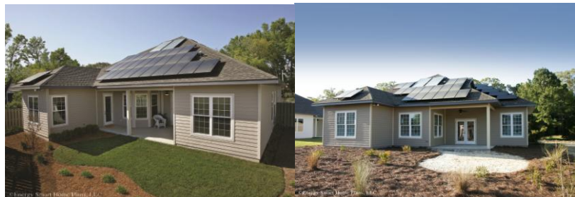
(Left) South roof of TW1 showing the PV arrays and the solar domestic hot water (DHW) panels at roof peak. (Right) South roof of TW2.

The table to the left shows measured home-performance data for a 7.5-month summer period in 2011. The whole-house, cooling, and “other” energy uses for these homes are substantially lower than typical homes in northern Florida. Energy usage in TW1 is about 30% to 45% lower than a typical home and in TW2 it is about 60% lower. The difference in energy usage between TW1 and TW2 is primarily due to occupancy patterns. Zero utility bills over the measurement period are possible because of this high level of efficiency.