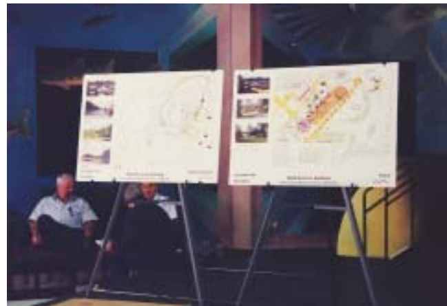
Potential Sites for the UNC-A New Science Building