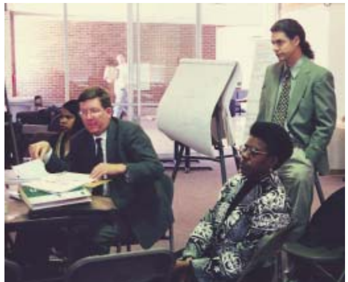
Energy group discussion and review of LEED criteria