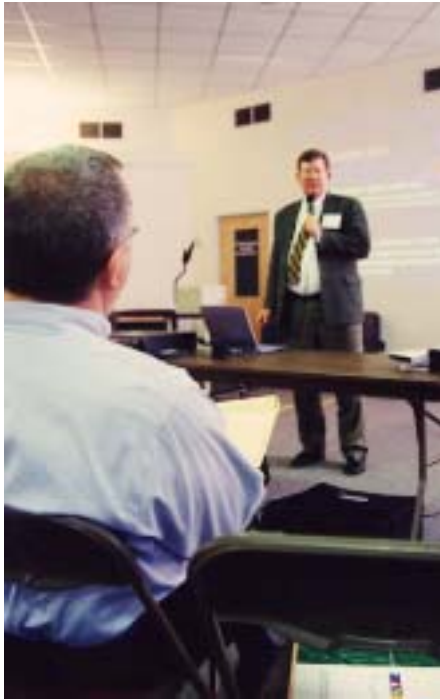
LEED for Labs Presentation