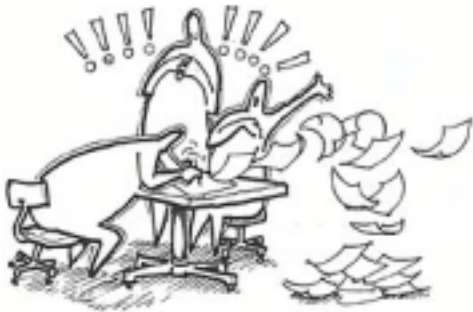
Greening Charrette Brainstorming

National experts in "integrated design", LEED, and the four areas facilitated the focus groups and gave educational presentations on their topics to the charrette participants. In addition, representatives from O'Brien Atkins and the University presented information on the project and potential project sites. UNC-A students shared their creative thoughts and ideas on the new building while numerous other participants were asked to join in the brainstorming and to become "champions" of the charrette results.