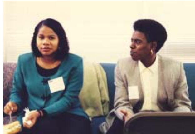
NC State Energy Office employees added significant input to the energy discussions