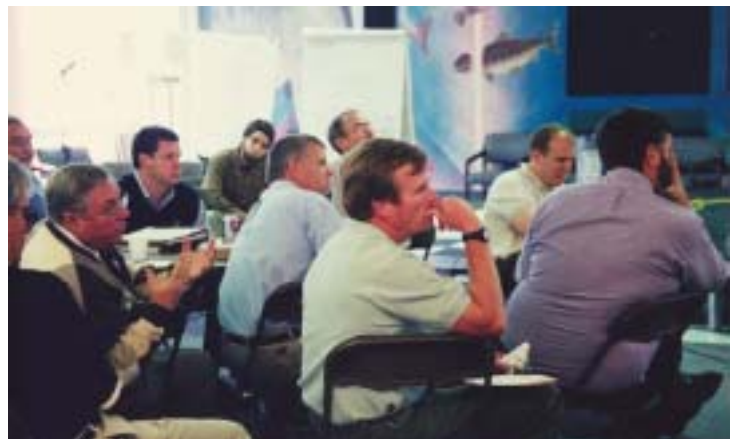
Discussion of potential energy options in the new building