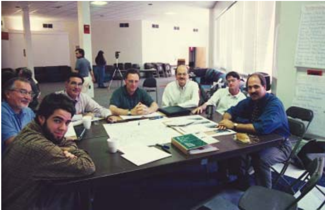
Site and Water Team Members