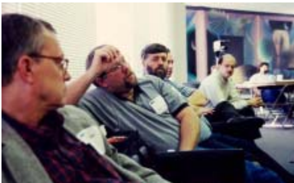
Greening Charrette Discussions

Throughout the Greening Charrette, the overall large group of charrette participants, as well as the three smaller “break-out” topic focus groups, all reviewed the LEED Green Building Rating System points. They determined that out of a potential 69 point system, the New UNC-A