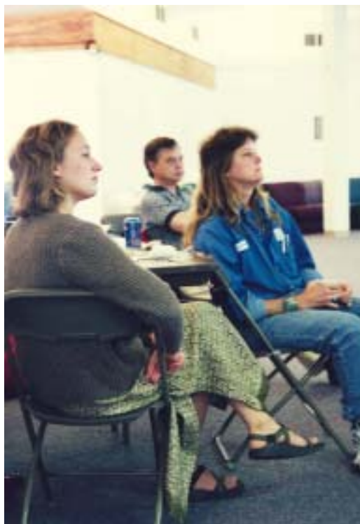
Discussing materials and indoor environmental quality for the New Science