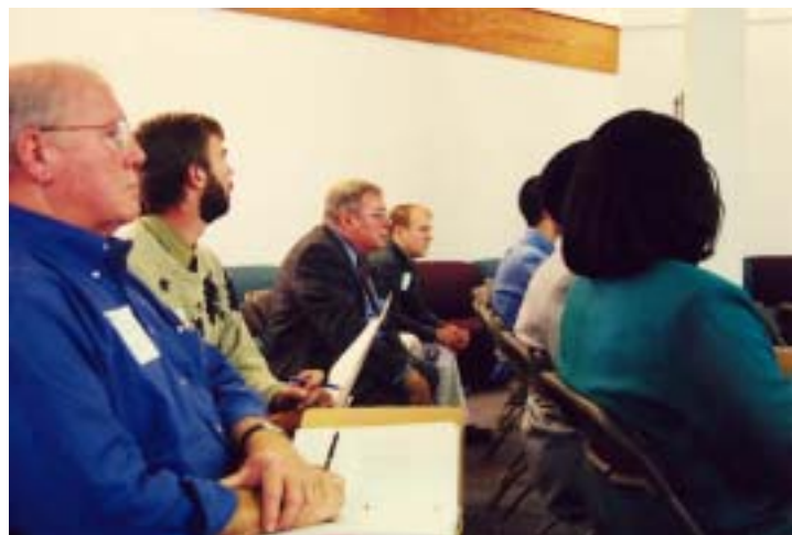
Energy efficiency presentation and questions