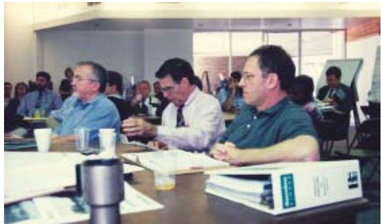
Reviewing site and water environmental considerations