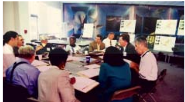
Work group discussing LEED points for Energy

The groups worked on these tasks until mid-morning, when a period for “cross-pollination” and “integration” was formally designated. Each group then sent one to two of its team members over to talk with the other work groups. All groups benefited from this exchange; with new ideas quickly generated while other ideas were challenged, praised, and/or ultimately coordinated. After lunch, each group was asked to appoint a speaker to relay their findings and insights regarding their specific LEED points.