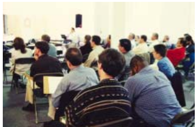
Participants listen intently to the various presentations

Before and after the lunch break, the large group listened to national sustainability experts describe the “integrated design process” and give quick overviews of the individual topic areas for the focused work groups: Site and Water, Energy, Materials and Indoor Environmental Quality. During and after each topic presentation, questions and answers brought insights and highlighted key concerns that must later be addressed by the charrette participants in their focused work groups.