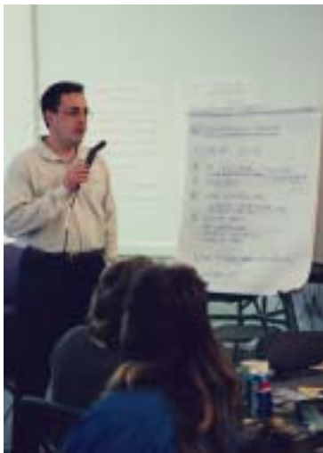
Reporting back to the other topic area groups

The group presentations generated good discussions and fruitful exchanges. Several participants had previously voiced skepticism that much could be accomplished in 1½ days; after the charrette presentations, several of those skeptics were quite amazed and impressed. They then voiced their support and approval for the endeavor and its results.