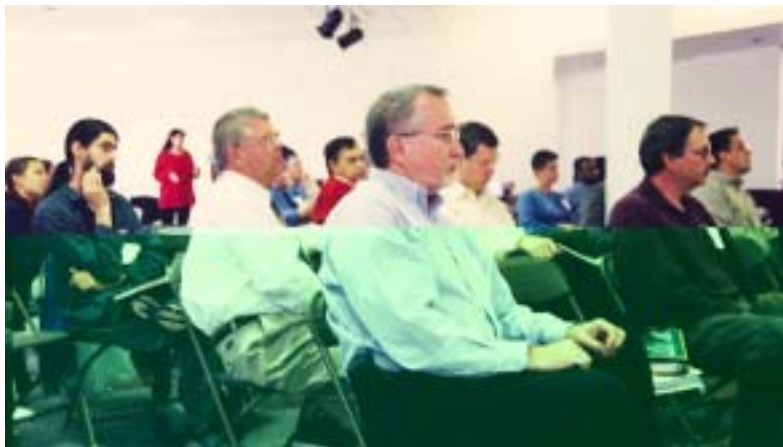
Greening Charrette participants for the New UNC-A Science Building

The charrette took place during September 2001 at the University of Asheville campus. Its stated focus: to incorporate environmental excellence and high performance, guided by the LEED Green Building Rating System, in the design of the University's New Science Building. Approximately 55 individuals participated from various backgrounds and fields: the University (faculty, personnel, students, administration, etc.), the community, state agencies, and private companies. Four distinct environmental design areas were addressed in detail: site & water, energy, materials and indoor environmental quality.