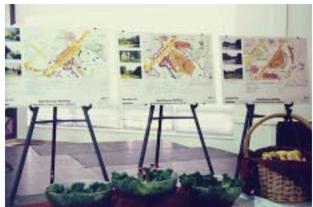
Potential sites for the UNC-A new Science Building