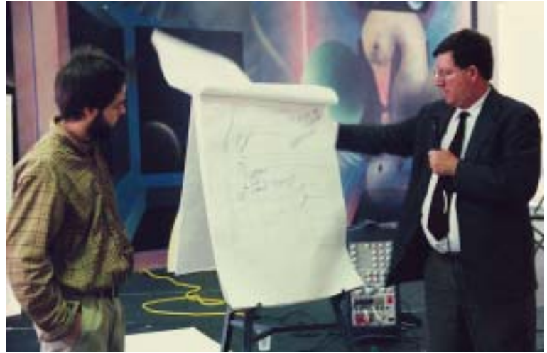
Integrated Design: Connecting site, water, and energy considerations