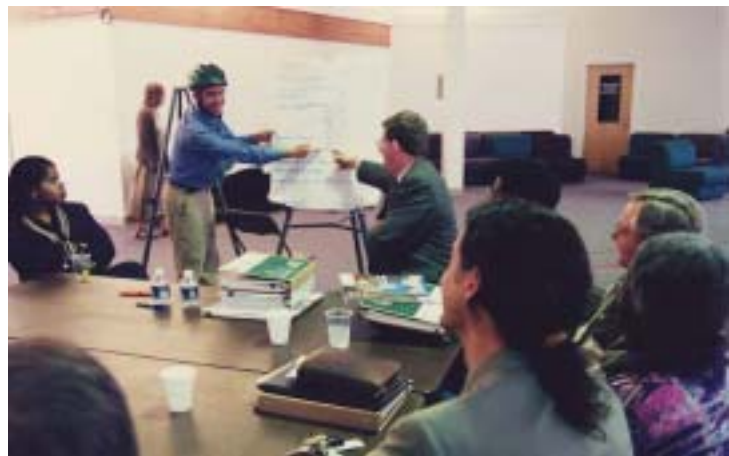
Discussion of energy performance levels that are both efficient and cost-effective