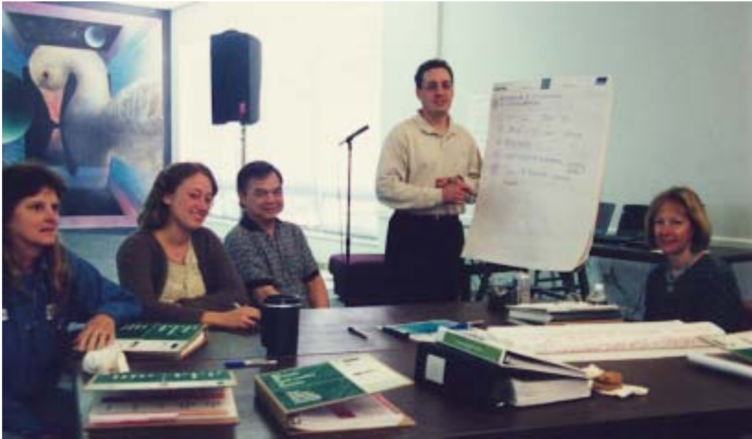
Materials and Indoor Environmental Quality Team Members