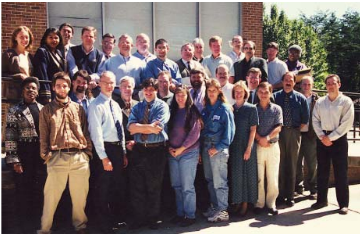
UNC- Asheville New Science Building Greening Charrette Team Members