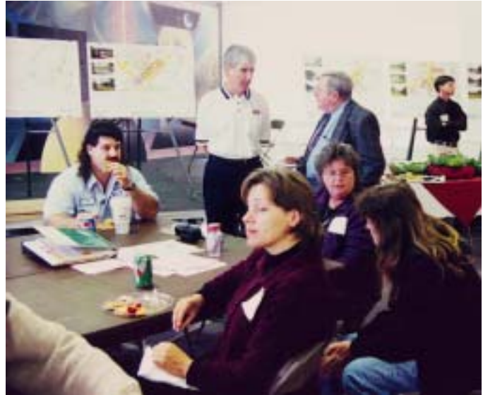
Lunchtime discussions about the New Science Building