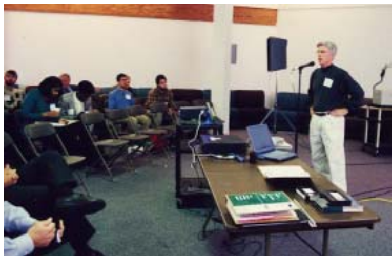
Project programming information presented to the charrette participants

The charrette participants worked both in a single large group, and as three focused working groups. Their goal: identify realistic and cost-effective "green" opportunities and objectives that would not only improve the project's performance levels but also satisfy the requirements of the LEED Green Building Rating System.