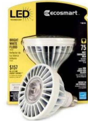
Ecosmart LED PAR38