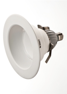
Ecosmart 6" LED Downlight