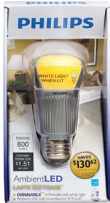
Philips 12.5W LED A19