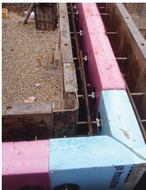
The 14-inch-thick foundation walls include a 4-inch XPS (R-20) rigid foam core, sandwiched between layers of concrete.

The ground source heat pump's central air handler circulates fresh incoming air that is brought into the home by an energy recovery ventilator. The ERV pulls air separately from the bathrooms and exhausts it outside, recovering heat from the exhausted air with a 52% total recovery efficiency. The ERV is equipped with a MERV 13 filter.