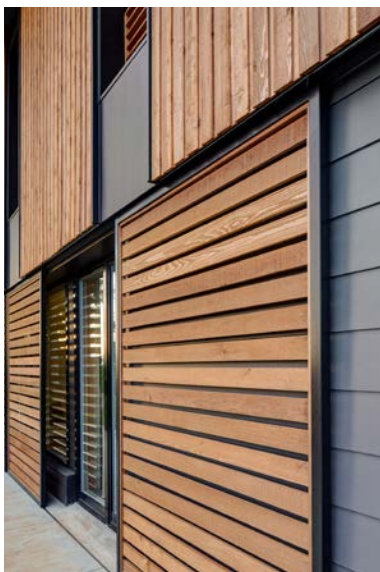
Sliding cedar shades block unwanted solar heat gain on hot summer afternoons.

One minisplit heat pump provides all of the heating and cooling the highly efficient home needs. While some homes are set up so that the HRV uses the central heating system's ducts to distribute air, in this home the heat pump uses the HRV's sheet metal ducts to distribute warm and cool air throughout the home. The inverter-driven system has a heating efficiency of 10 HSPF and a cooling efficiency of SEER 15.5.