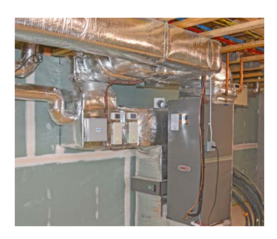
Space and water heating are both provided by a high-efficiency, wall-mounted, gas-fired boiler.

Despite the corner-lot orientation limitations, space was planned on the south-facing roofs for a 6.9-kW PV panel array. "The PV system should offset the home's connected loads, resulting in no electric bills, under normal use," said Wertheim. With the solar panels, the home is expected to reduce energy costs by about $2,500 compared to a similar sized home built to the 2009 International Energy Conservation Code.