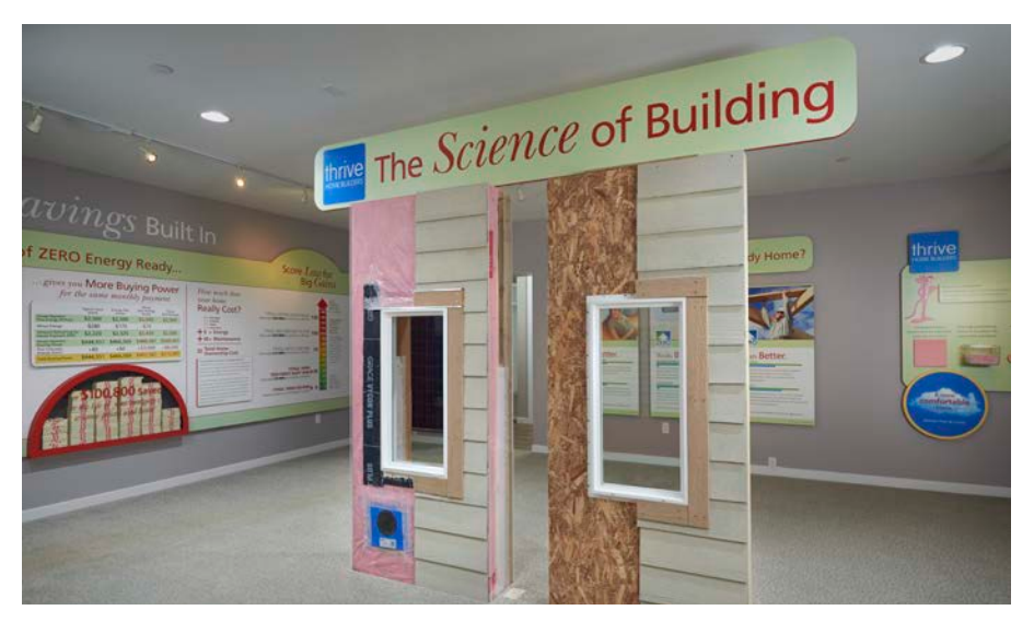
Thrive's sales center educates home buyers on all the benefits of DOE Zero Energy Ready Home construction.

ENERGY STAR windows, appliances, and efficient lighting further energy savings. Each home is equipped with an internet-based system to track the home's solar energy production and electric consumption.