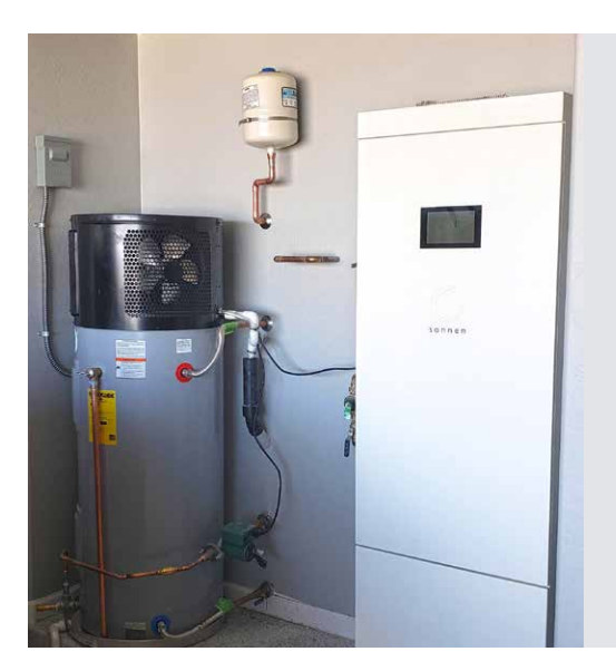
An efficient heat pump water heater provides hot water for the all-electric home while the 10kW battery storage system covers late afternoon energy demands.

are controlled by timer-based wall switches and also have humidity sensors that will automatically turn on the fan if high humidity is detected.