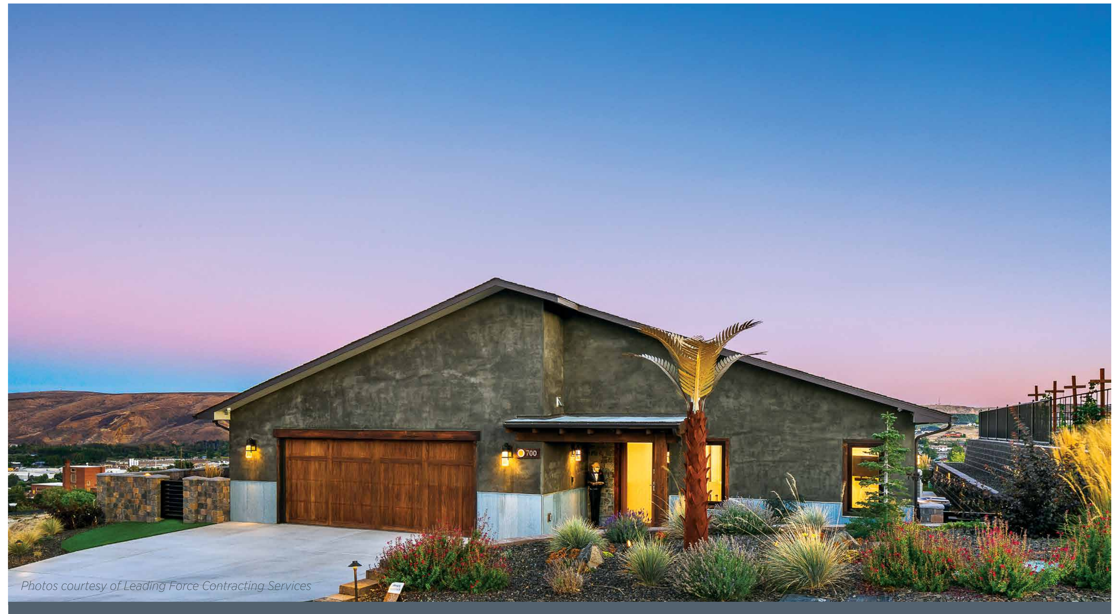
"In the end, our electric bill is $8.96 a month—just the electric utility service fee." Homeowner