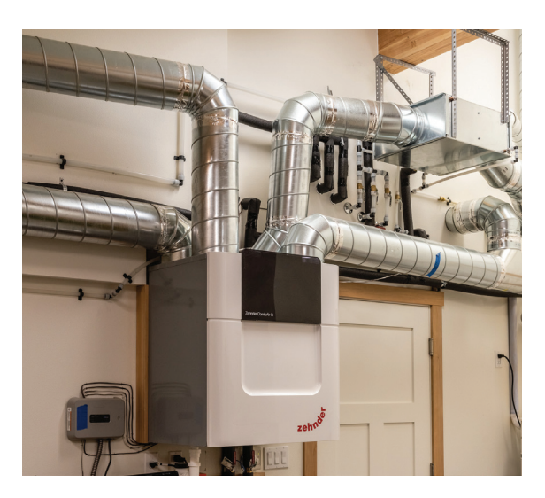
This home's Heat Recovery Ventilator (HRV) system keeps indoor air fresh and temperatures consistent.

also provides hot and chilled water to fan-coil units located in the first-floor master bedroom and the second-floor library, which is open to the first-floor living space. There is also a third heating system, an in-floor hydronic system, which also uses water heated by the air-to-water heat pump. Testing of the cutting edge $1,000 HRV coil has been so successful that the two backup systems (the fan coils and the hydronic floor heating and cooling) may not be needed.