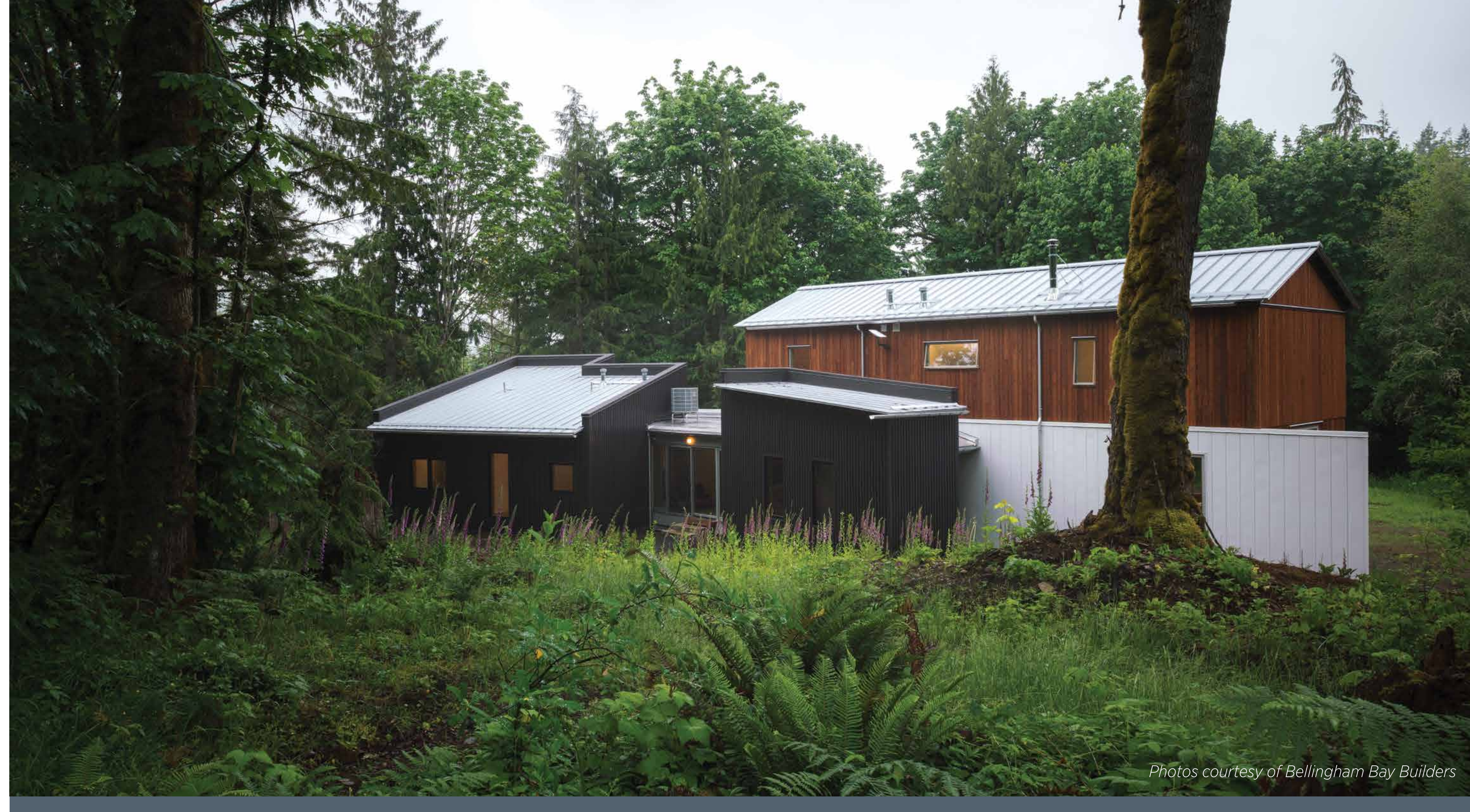
"I haven't looked at a thermostat since we moved in." Homeowner