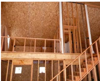
The SIP panels provide insulated attic spaces and cathedral ceilings.

unnecessary in the mild marine climate. One bathroom fan is set to exhaust continuously at a low speed to provide ASHRAE 62.2-required indoor ventilation. Makeup air is provided by a HEPA filtered vent duct. The intake duct has a damper that will open passively whenever the 80-cfm bathroom exhaust fans are operating. The ventilation duct is also equipped with its own fan to push fresh air into the home. The fan will come on full speed when the 206-cfm kitchen range