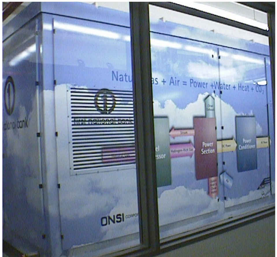
UTC Power PC25C fuel cells installed in the basement of First National Bank of Omaha’s Technology Center in Omaha, Nebraska.

First National has reduced its energy costs by selling electricity to the utility and using waste fuel cell heat, and benefited from the exceptional (99.9999%) availability of its fuel cell system. Since the system began operating in 1999, the Technology Center has never experienced a system shutdown. Once, an accidental interruption in service by the natural gas supplier shut down the fuel cells. However, due to the redundant de-