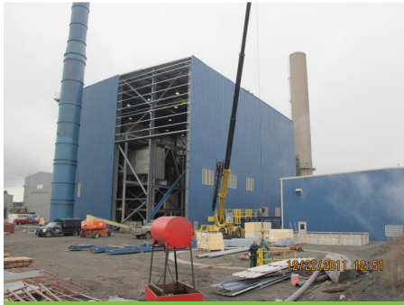
The boiler weighs over 1 million pounds and is kept in a 17,000-square-foot boiler house along with supporting equipment.

To accommodate the boiler on site, a new 17,000-square-foot boiler house and 290-foot exhaust stack were constructed. Nearly 620 feet of new 66-inch pipe was installed to carry the BFG to the boiler. A feedwater economizer and combustion air preheater were installed to remove waste heat from exhaust gases and improve the boiler efficiency. Draft fans, feedwater pumps, and a deaerator were also constructed to support the operation.