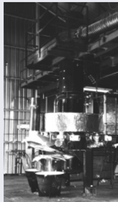
The Cupola Furnace: Experimental Cupola and Schematic of Cupola Process