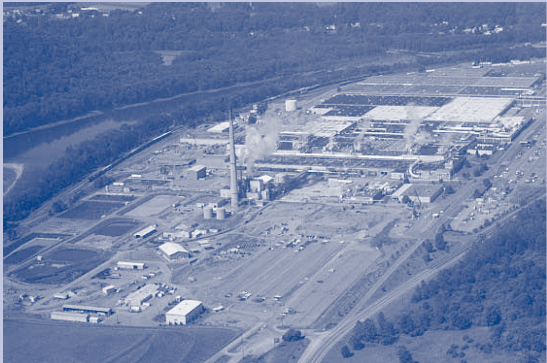
Procter & Gamble's mill in Mehoopany, Pennsylvania

adjustment on one unit affected the operation of the others. As a result, all six units operated at full load to meet the estimated system demand of 16,000 scfm. Operating the compressors in this way led to constant blow-off of 1,000 scfm in excess air. In addition, pressure fluctuations prompted the operators to try to maintain a higher system pressure than necessary.