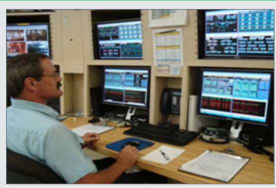
A Nissan employee monitors equipment to ensure it only runs when needed.

the significance of energy throughout their respective plants. Nonetheless, it took some time for employees' mentality about using submetered data to change. Plant managers and their staff had to overcome the mindset of "this is how the plant has always run." There were instances of significant pushback from plant staff that believed equipment failure would occur if there were shutdowns between shifts and on the weekends in order to conserve energy. In addition, some staff members believed that they had already employed all reasonable energy conservation efforts and were reluctant to seek other methods of reducing consumption. Encouraging employees to not only change the processes and procedures they were used to, but to also embrace the new sub-metering technology required strong support and communication from a respected leader.