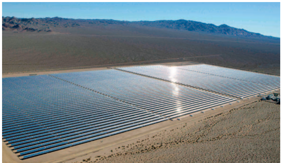
64-megawatt solar plant in Boulder City, Nevada

Contact the EERE Information Center 1-877-EERE-INF or 1-877-337-3463 or visit www.solar.energy.gov or www.solaramericacities.energy.gov