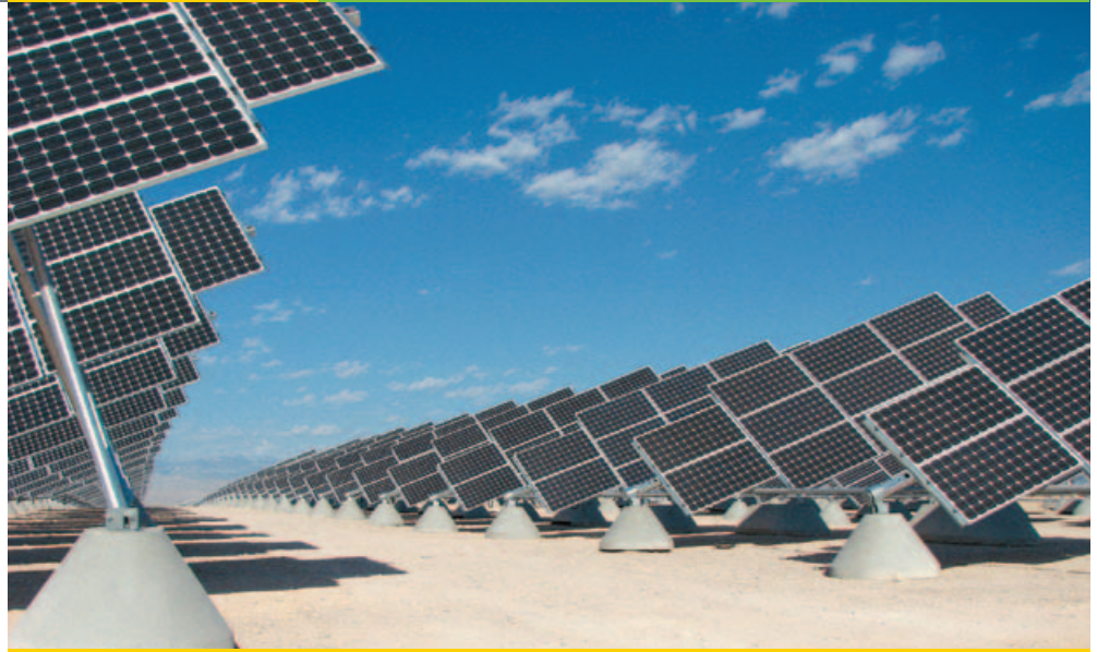
14.2-megawatt solar electric system at Nellis Air Force Base, Nevada