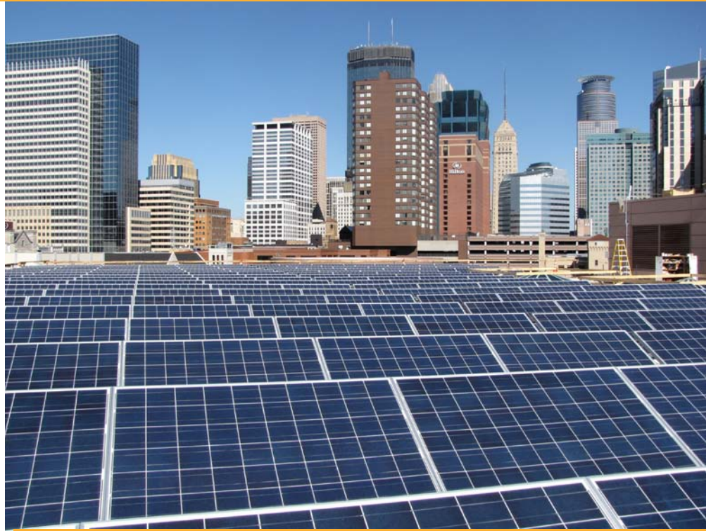
The Minneapolis Convention Center features a 600 kW solar rooftop installation.

To achieve SunShot's goal, DOE has structured its R&D funding to enable efforts along the entire PV technology development pipeline, including new devices and processes, prototype design and pilot production, and systems development and manufacturing. The Next Generation PV Program funds high-risk proof-of-concept projects at the fore of the pipeline. Discoveries made and demonstrated here can then be further