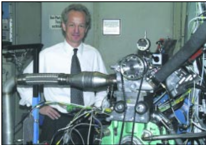
Dynamometer tests of the VCR engine concept validated computer modeling results.