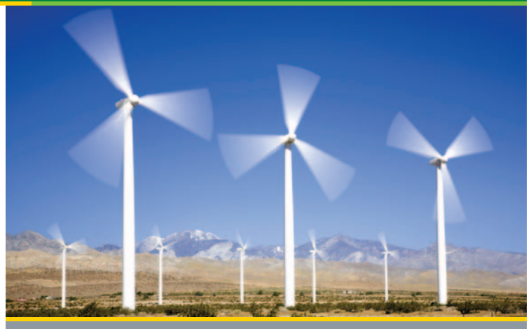
The potential U.S. land-based wind resource is about 10,000,000 megawatts.

The renewable energy industry creates thousands of long-term, high-technology careers in wind turbine component manufacturing, construction and installation, maintenance and operations, legal and marketing services, transportation and logistical services, and more. In 2009 and 2010, the wind sector invested roughly $27 billion in the U.S. economy and employed about 85,000 workers.